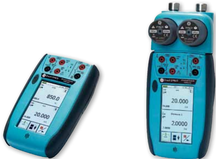
Measure and source mA, mV, V, ohms, frequency, RTD's and thermocouples.

The simple yet sophisticated design and concept combines, for the first time, an advanced electrical calibrator with state-of-the-art pressure measurement and generation, so that there is no longer any need to compromise one measurand capability in favour of another.