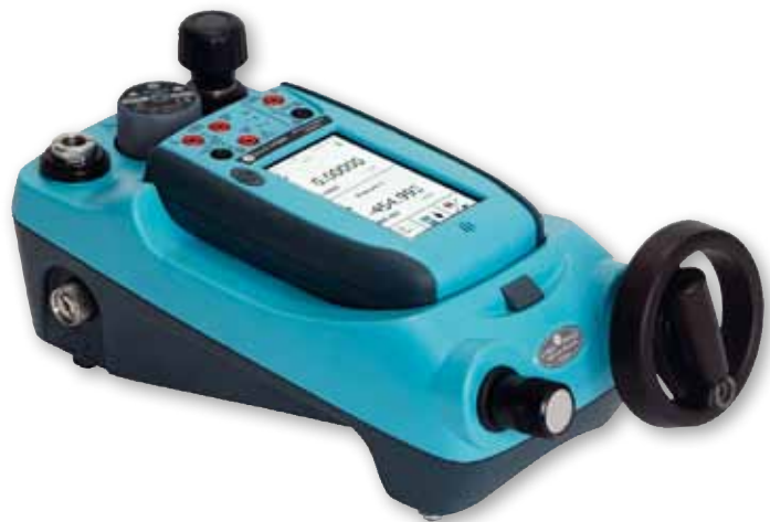
Re-rangeable pressure measurement and generation from 25 mbar (10 inH 2 O) to 1000 bar (15000 psi)