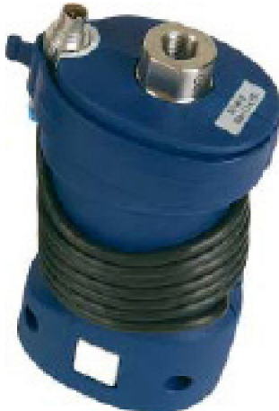
External IDOS universal pressure module

*Provides absolute pressure option in addition to gauge pressure. In absolute mode adds barometric pressure to gauge pressure range. For absolute mode ranges below 1 bar please consult your sales representative.