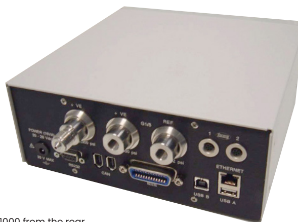
PACE1000 from the rear