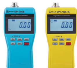
DPI 705E Pressure Indicator

The day-to-day test and calibration tools you can rely on. Druck's Essential product range is tough, reliable, accurate and easy to use. So you can get on with your job and trust our Essential range to do theirs. And if you need higher accuracy, or wider functionality, our Expert and Elite ranges have you covered.