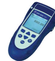
DPI 800 Pressure Indicator: Higher Accuracy