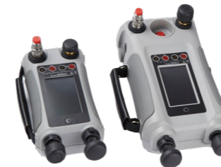
DPI611 & DPI612 Handheld pressure calibrators