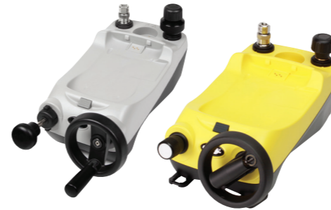
Hydraulic and Pneumatic Pressure generation bases