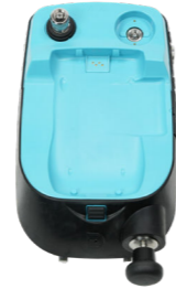
PV624 Hybrid pressure controller