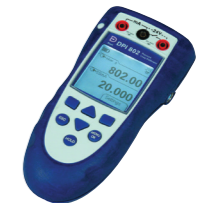
DPI 802 Pressure Indicator with mA