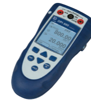
DPI 880 Multifunction Calibrator