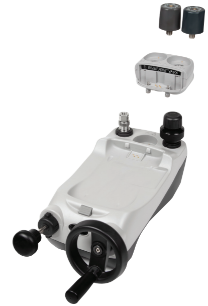
DPI620 GENii Modular calibration system