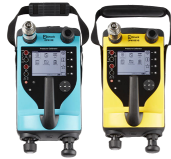
DPI610E Series Pressure Calibrator

Our high performance Expert range provides incredible calibration capability built around Druck's benchmark reliability, accuracy and ease-of-use. This high accuracy range gives you leading mobile calibration for electrical, temperature and pressure applications. And if you need wider test and calibration solutions, our Essential and Elite ranges have you covered.