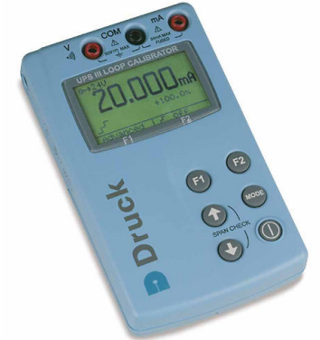
UPS-III Rugged and Extremely Compact Loop Calibrator

⚠ Safe and Hazardous area versions available