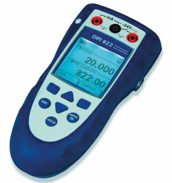
DPI 822 Handheld Thermocouple Calibrator