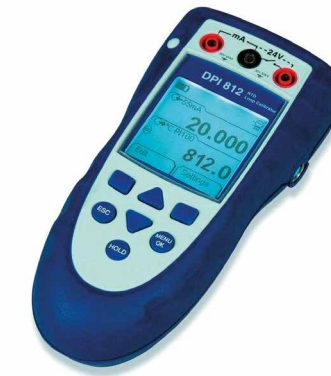
DPI 812 Handheld RTD Loop Calibrator