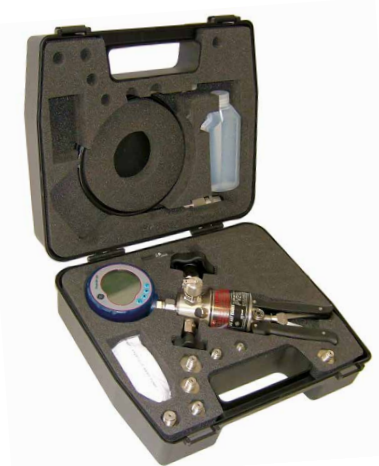
PV Hand Pump & DPI 104 Indicator Packages