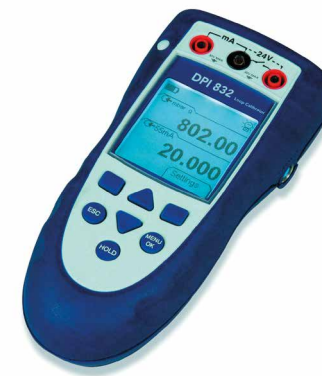
DPI 832 Handheld Electrical Loop Calibrator