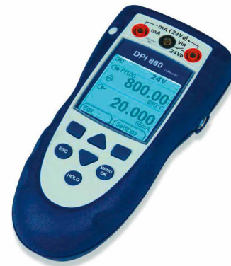
DPI 880 Handheld Multi-function Calibrator

[ Cost-effective, highly accurate and packed with features ]