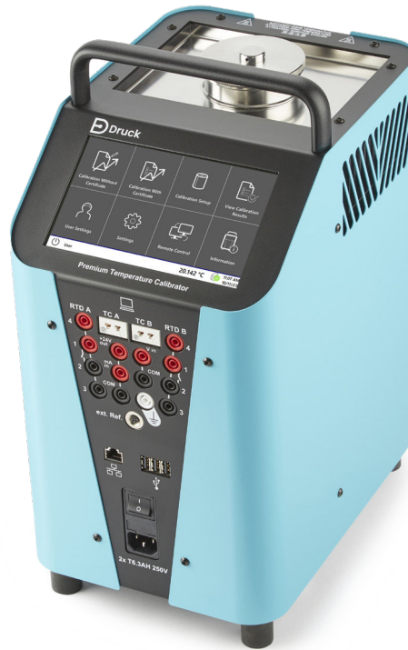
PTC165i Integrated measuring model