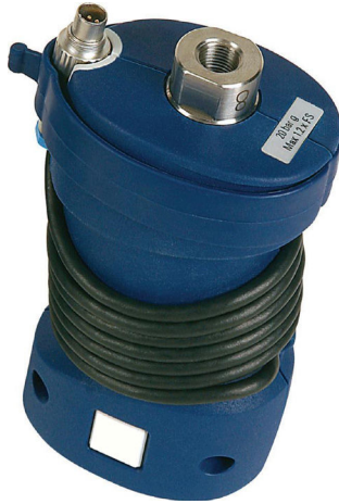
External IDOS universal pressure module

*Provides absolute pressure option in addition to gauge pressure. In absolute mode adds barometric pressure to gauge pressure range. For absolute mode ranges below 1 bar please consult your sales representative.