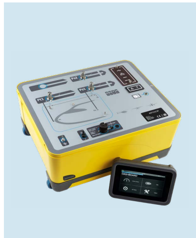
ADTS 5XX Series