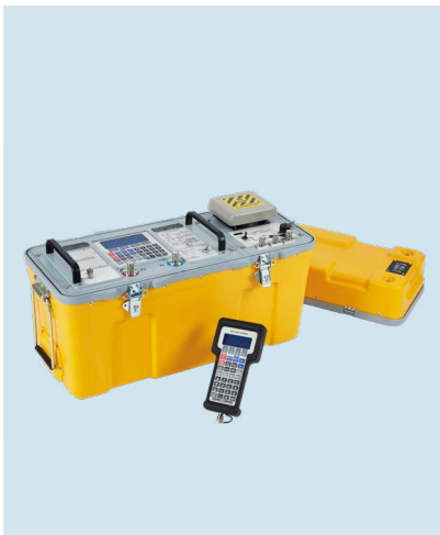
ADTS 405 MkII

This modern calibration solution alternative gives operators a robust, maintenance free, and portable solution built on Druck's industry-leading pressure measurement expertise.