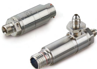
NG3000 pressure sensors

Druck's new NG3000 fully configurable platform is an ideal pressure sensor for all types of aerospace and aviation applications.