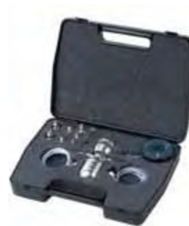
Low pressure pneumatic test kit

Includes: DPI 104-IS; ranges to 10,000 psi (700 bar), PV 411A combined pneumatic and hydraulic test pump, hydraulic reservoir, hose, adaptors, seal kit and case.