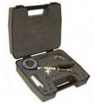
Pneumatic test kit