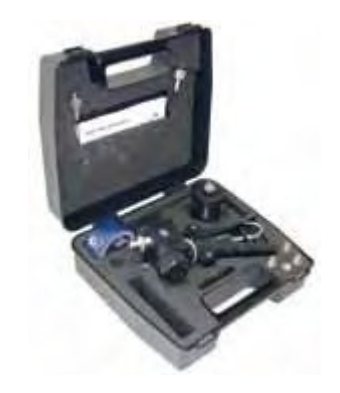
Pneumatic and hydraulic test kit