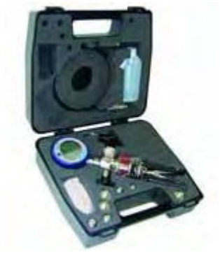
Hydraulic test kit