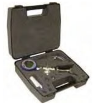
Pneumatic test kit