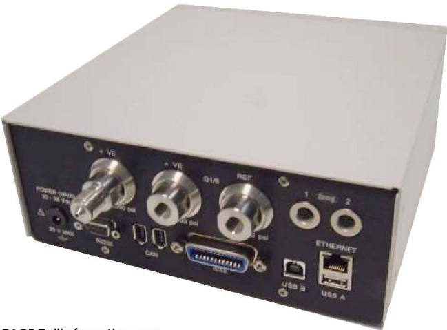
PACE Tallis from the rear

Tallis will be supplied with appropriate standard compliance labelling (STD). Additional regional specific labelling may also be made available as required